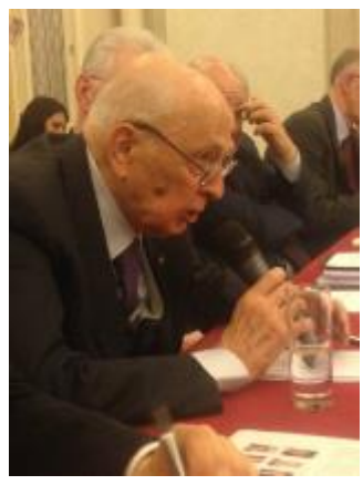
"It is urgent to restore the authority of the European institutions if the EU is to address the refugee crisis", Giorgio Napolitano

The migration crisis is additional evidence of the institutional and governance weaknesses of the Union. Solidarity between Member States is at history lows, and the Visegrád group is adopting very dangerous positions that are preventing the EU from taking effective action. Therefore, national solutions prevail and fences are dressed across Europe. But building fences will not ensure European citizens' security. The Union must be united to face this challenge. A European Border and Coast guard and European intelligence capabilities together with a single European asylum and migration policy are a must. On the external front, only if it is united and makes progress towards a European foreign and